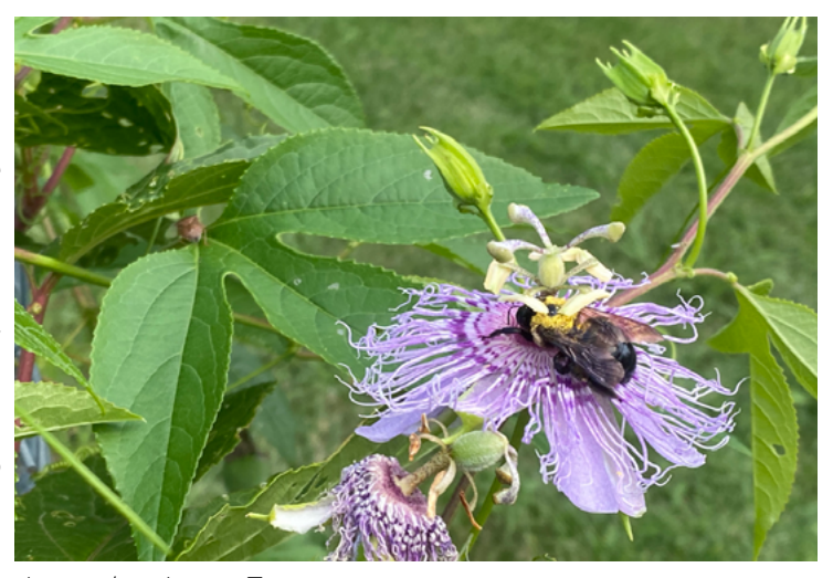
Photo is of a carpenter bee, ( Xylocopa virginica ) visiting passionflower ( Passiflora incarnata ) in James's backyard.